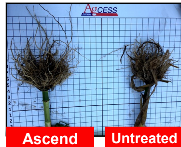
Right photo: Side-by-side root comparisons show fuller, longer roots in Ascend (left side).

Crop Insurance Note — Jim Ward If you intend to use your crops for silage or any other purpose, please let your crop insurance agent know before doing anything. Or if you're still carrying old crop in your bins, let us know before starting harvest. Old crop must be accounted before harvest begins. It can affect your yield and potential loss of payment.